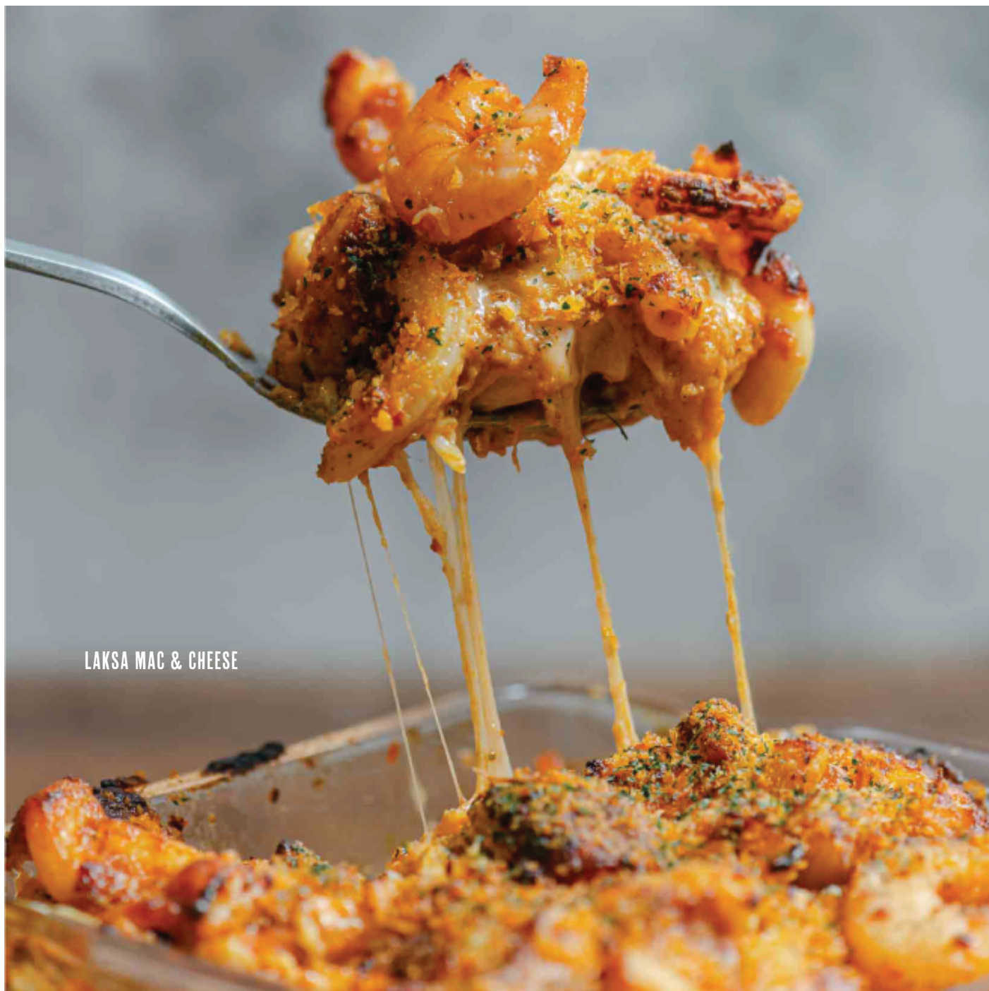
LAKSA MAC & CHEESE