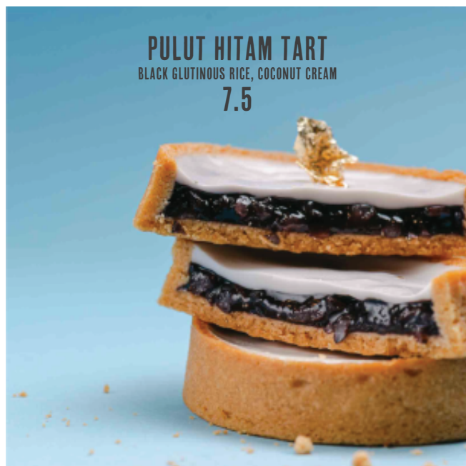
PULUT HITAM TART BLACK GLUTINOUS RICE, COCONUT CREAM 7.5