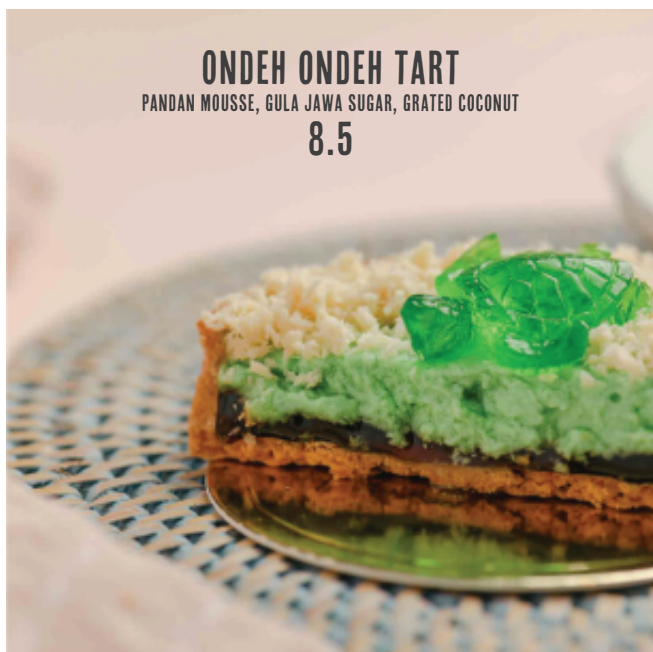
ONDEH ONDEH TART PANDAN MOUSSE, GULA JAWA SUGAR, GRATED COCONUT 8.5