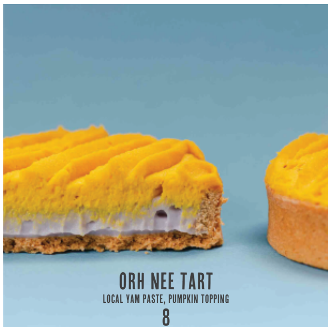
ORH NEE TART LOCAL YAM PASTE, PUMPKIN TOPPING 8