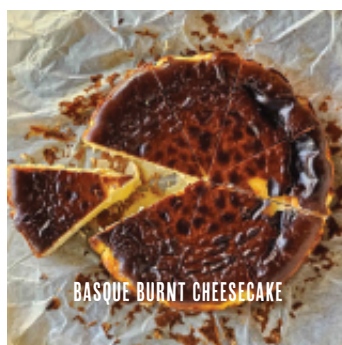
BASQUE BURNT CHEESECAKE

COOKIES & CREAM ROASTED PISTACHIO VANILLA MACADAMIA DARK CHOCOLATE PEPPERMINT CHOCOLATE SUMMER STRAWBERRIES CLASSIC COCONUT MANGO PASSION SORBET