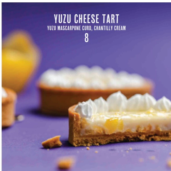
YUZU CHEESE TART YUZU MASCARPONE CURD, CHANTILLY CREAM 8