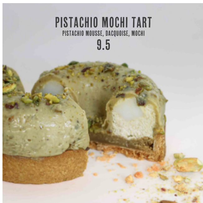
PISTACHIO MOCHI TART PISTACHIO MOUSSE, DACQUOISE, MOCHI 9.5