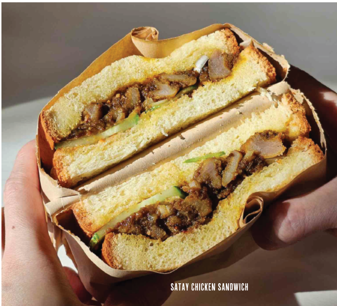
SATAY CHICKEN SANDWICH

Toasted brioche, grilled cheese - cheddar, mozzarella, emmental, gouda