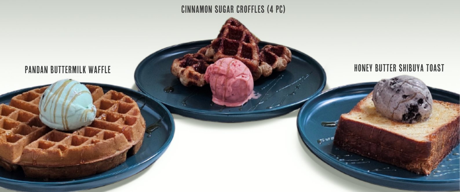
PANDAN BUTTERMILK WAFFLE