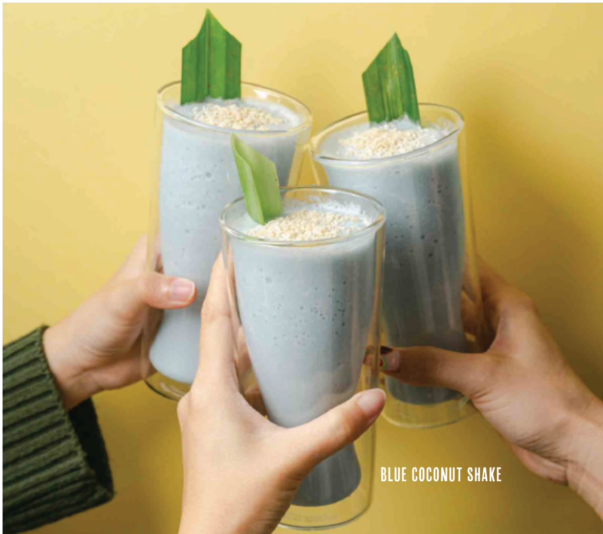
BLUE COCONUT SHAKE