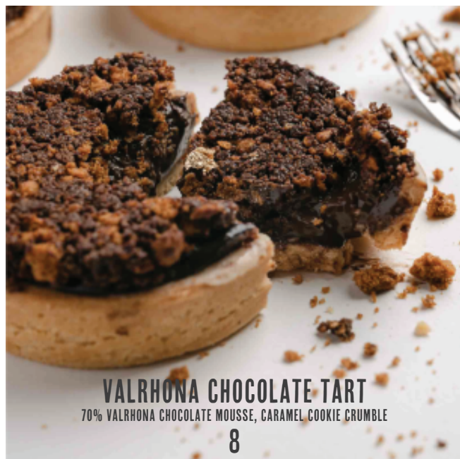
VALRHONA CHOCOLATE TART 70% VALRHONA CHOCOLATE MOUSSE, CARAMEL COOKIE CRUMBLE 8